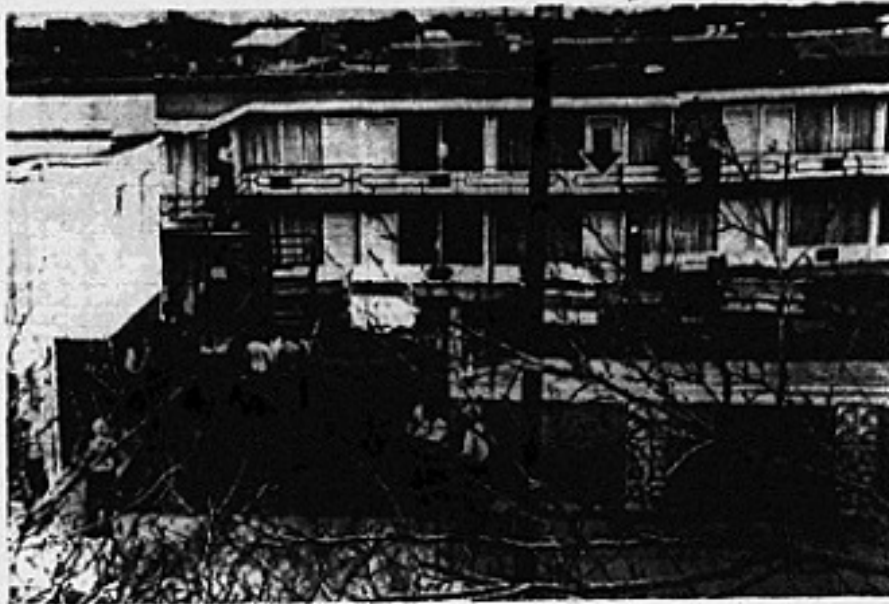
Arrow indicates where Dr. King was standing when assassinated