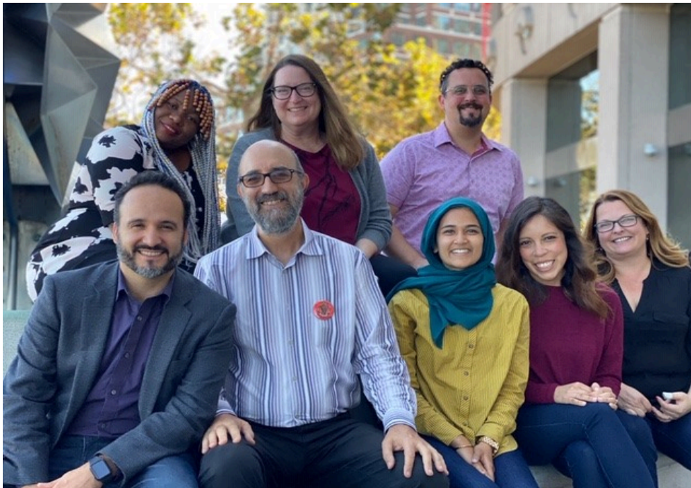
Our housing justice team

A nonprofit law firm and advocacy organization founded in 1971 that challenges the systemic causes of poverty and racial discrimination by strengthening community voices in public policy and winning tangible legal victories advancing education, housing, transportation, & climate justice.