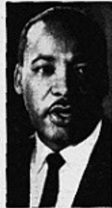
DR. MARTIN LUTHER KING